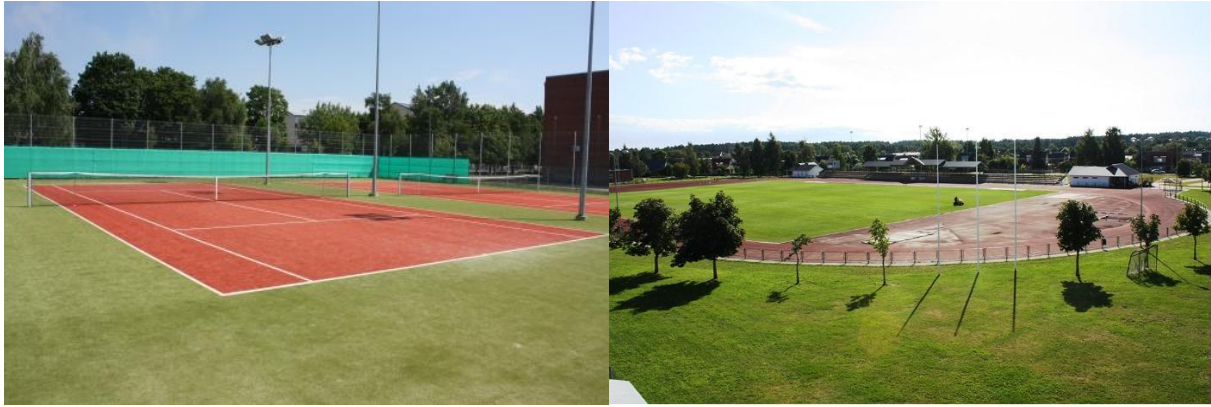
Tennis court and athletics stadium.

All fencers and coaches are accommodated right after the Nordic Championships (on 24.09.2017) in Haapsalu Sports Centre Hostel. On 29.09.2017 there will be shuttle buses from Haapsalu Sports Centre to Tallinn according to the departure times.