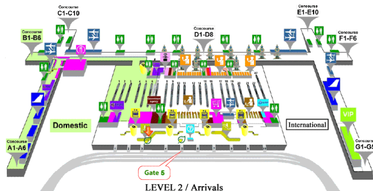
Meeting Point at Suvarnabhumi International Airport, GATE 5

All passengers entering Thailand must possess valid passports. Participants are recommended to check with local Thailand Embassies for visa applications before traveling. In order to obtain a visa, participants are requested to send by E-Mail: ajcfc2017.korat@gmail.com copy of their passports. The organizing committee will take care of the necessary formalities has to be received by the Organizing committee not later than Friday, 13 January 2017 .