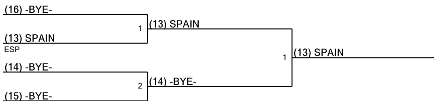
Table of 2 (Pl. 13-14)