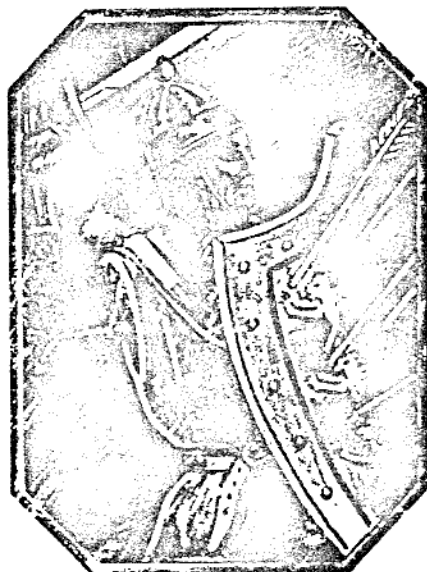
DER WACK'RE SCHWABE