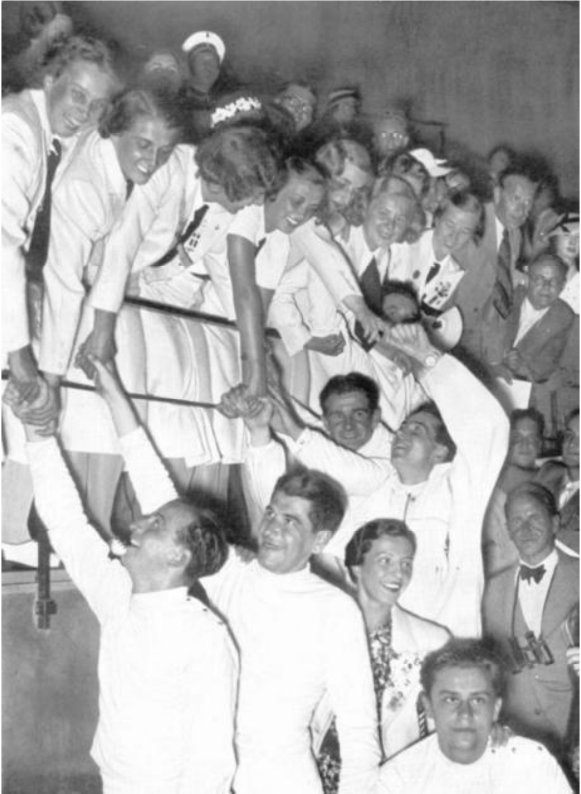
Hungary's lady athletes are on hand to congratulate their victorious countrymen following the match with Italy.