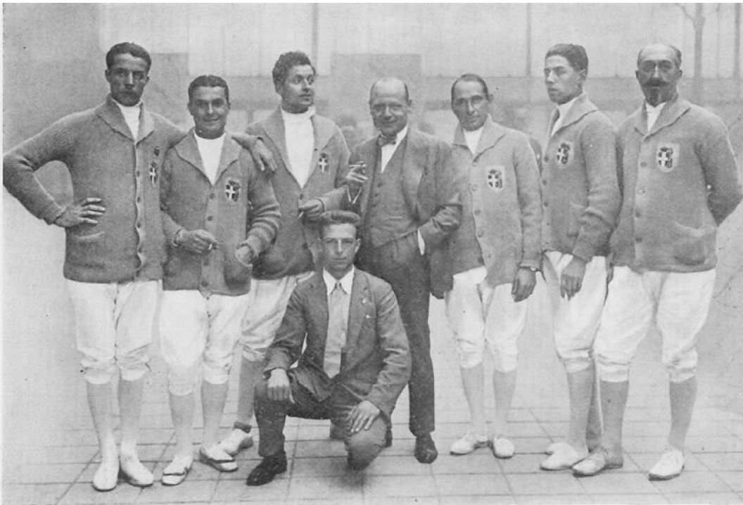
The Italian Team.