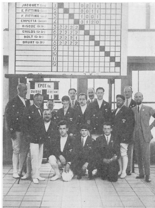
Swords, team. Switzerland.