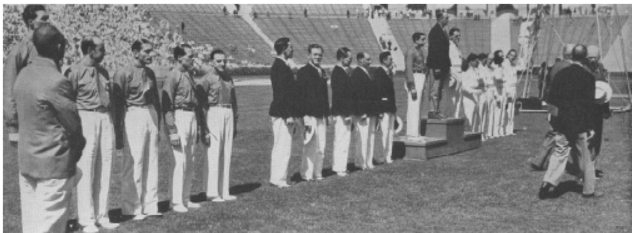
THE VICTORIOUS FOILS TEAMS WITH THE CAPTAINS ON THE VICTORY STAND

France, Italy and United States, all ended in a tie for first place, winner to be decided in "tie run-off" bout.