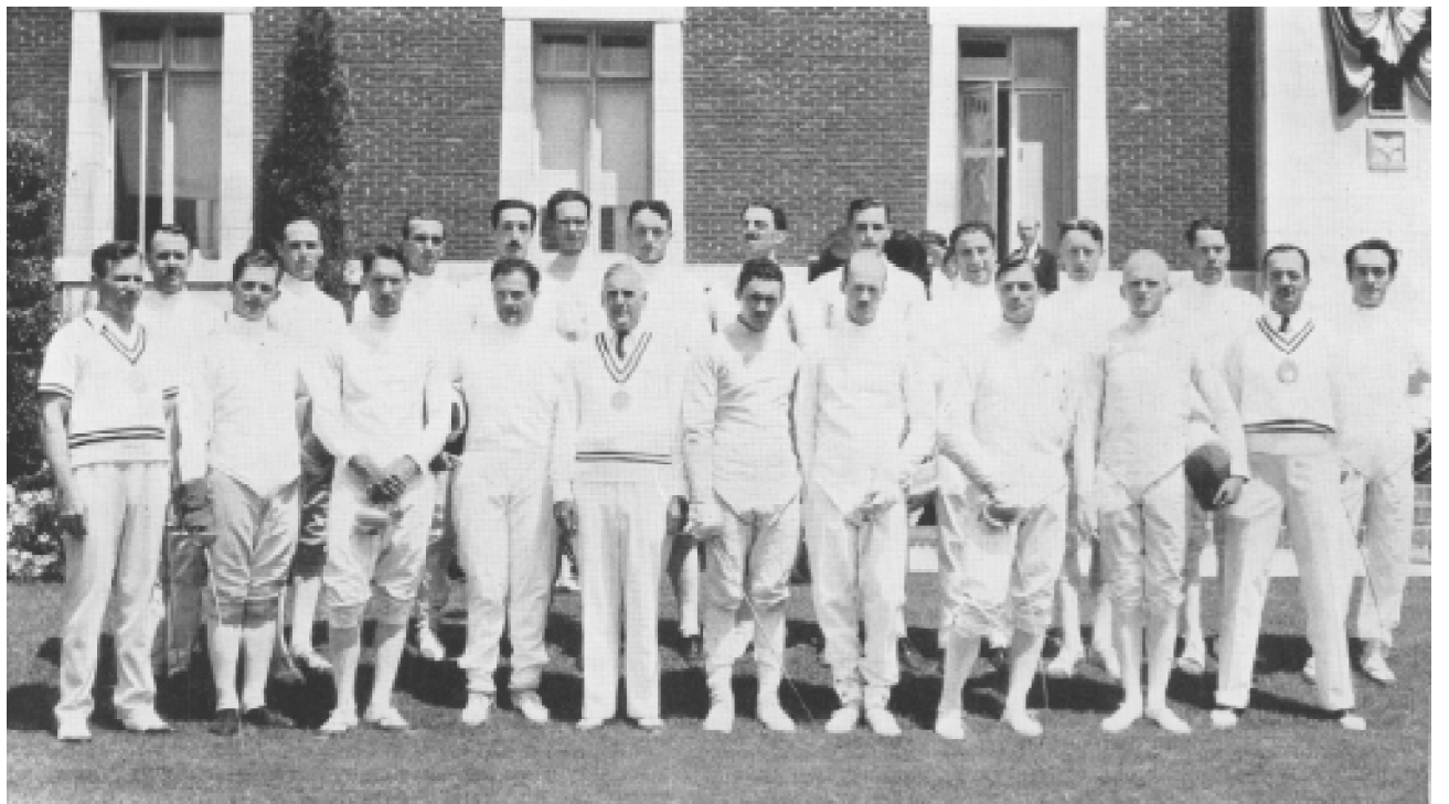
FENCING SQUAD OF THE UNITED STATES, INCLUDING THE FOILS TEAM WHICH WON THIRD PLACE