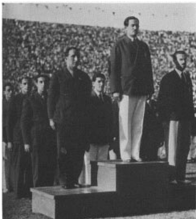
CHAMPIONS OLYMPIQUES SABRE TEAM, HUNGARY-THE ITALIAN, HUNGARIAN AND POLISH SABRE TEAMS LINED UP IN THE VICTORY CEREMONY