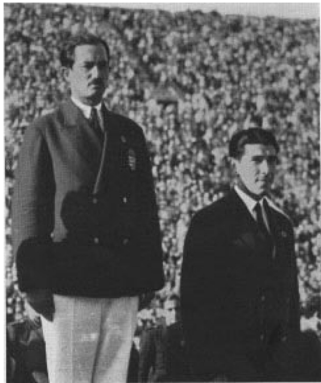
CHAMPION OLYMPIQUE GEORGE PILLER, HUNGARY, INDIVIDUAL SABRE CHAMPION, LEFT, ON VICTORY STAND, WITH ANDREW KABOS, HUNGARY, THIRD