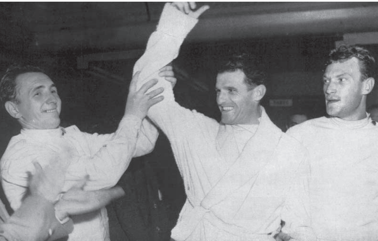
The three sabre Medallists. From left—Pawlowski, Kárpáti, and Kouznetsov.